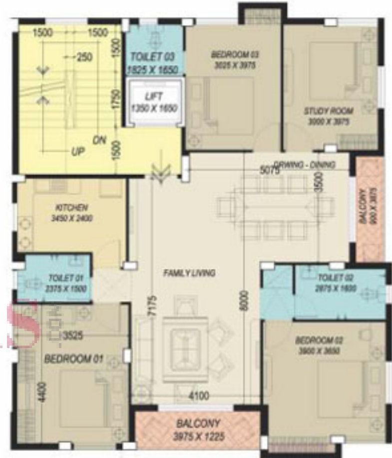
SUPER BUILT UP AREA - 2450 SQFT. TYPICAL (1ST, 2ND, 3RD & 4TH) FLOOR PLAN